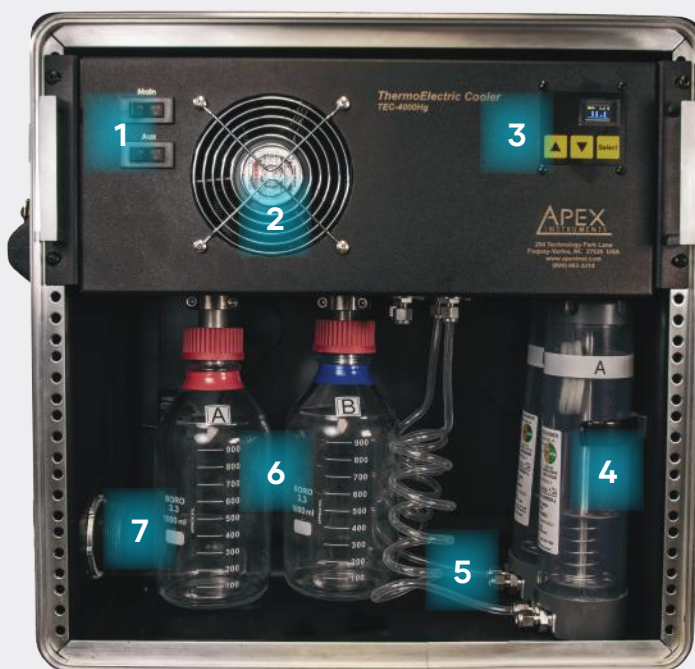
5. Connector Tubing