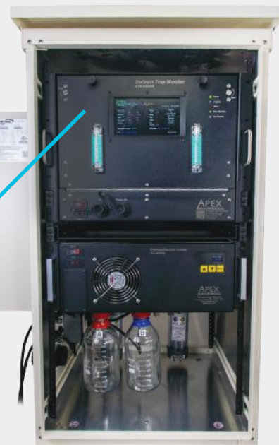
STM-6000RM Automated Mercury Console

(Shown in CR-20U MercSampler Rack Mount Cabinet. Including the TEC-4000 HG Thermoelectric Gas Cooler)