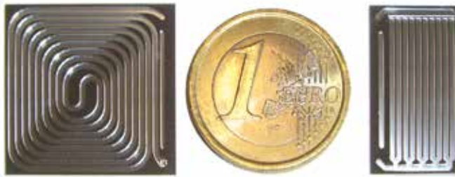
MEMS for pre concentration and gas chromatographic separation

- Micro Electro-Mechanical Systems (MEMS), applied to the selective preconcentrator and to the column of chromatographic separation (proprietary technology)